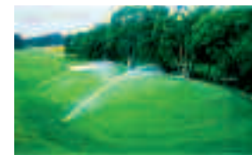
Reducer via water injection